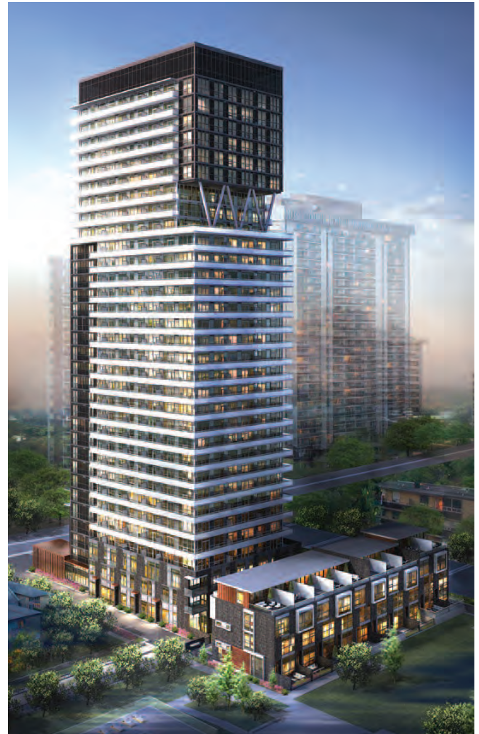
101 Erskine's statement-making profile and signature townhomes.